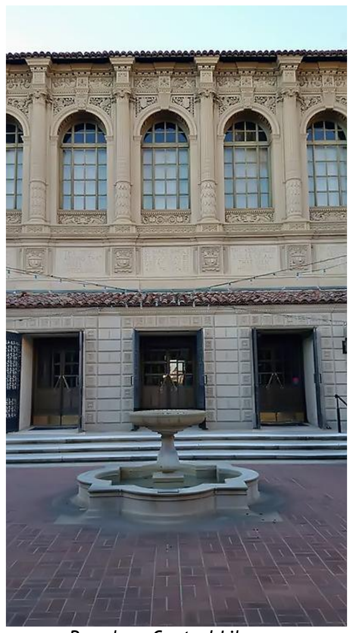
Pasadena Central Library

the concepts of sanctuary and the landscape of thought, he discussed seven properties of thoughtspace, breaking them down further into 35 'qualities.' His upcoming book will illustrate each of the 35 qualities with 6 represented haiku. Unfortunately, we only had the auditorium reserved for a 90-minute presentation, so Richard was only able to show haiku for some of the various qualities in each property, but ran out of time before he could show all of them.