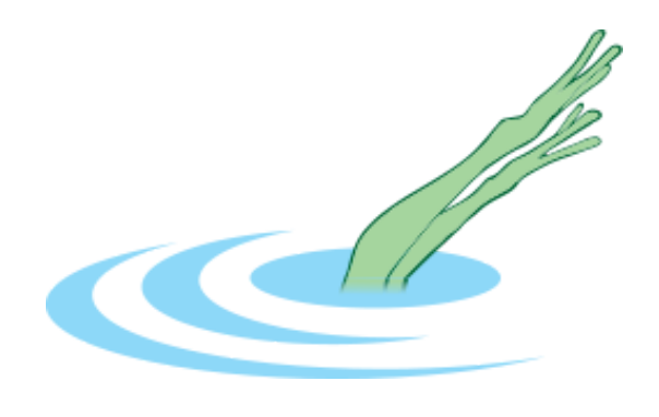
Haiku Society of America | P.O. Box 31 | Nassau | NY | 12123