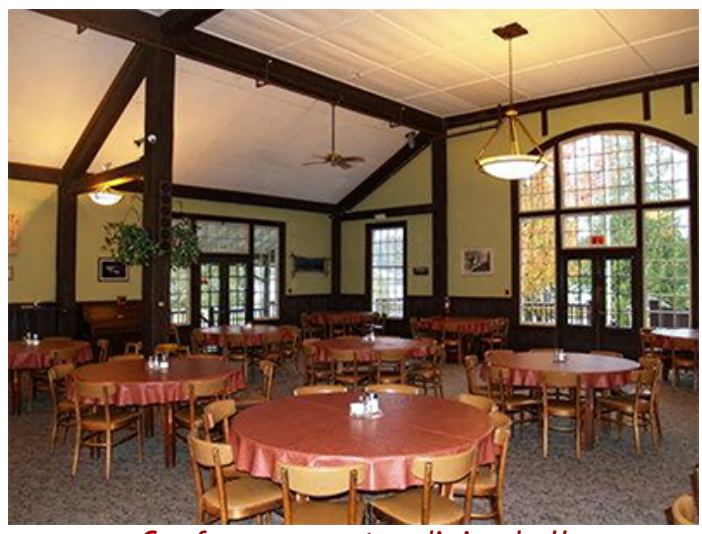
Conference center dining hall

Go to <u>www.haikunorthwest.org</u> for the 2016 retreat registration form. Numerous options are available, including day rates with no accommodations.