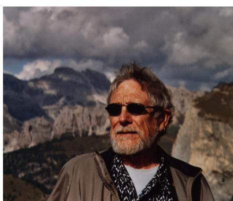
Gary Snyder

enrich lives, the American Haiku Archives is dedicated to the collection, preservation, and promotion of this poetry as a vital component of literature in the English language. Established 12 July 1996 as an inclusive educational and scholarly resource at the California State Li-